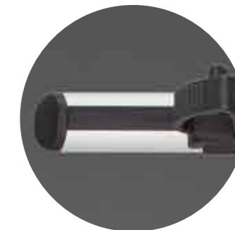
Beltstow designed to tidy straps away securely when a ladder is not in use